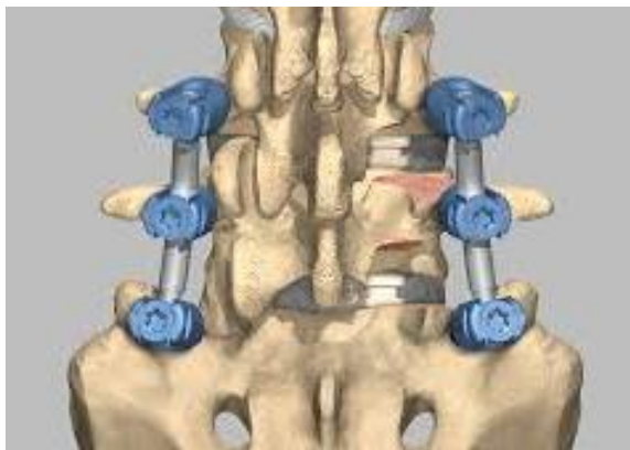
Pedicle screw fixation