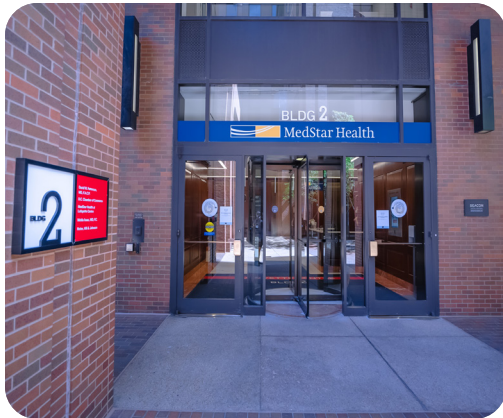
Lafayette Centre Building 2 lobby entrance from the courtyard

Our MedStar Radiology Network offers services on the 8th floor of Building 2. These services include 3D mammography, CT, cardiac calcium scoring, DEXA, ultrasound, and X-ray. If you are in need of an MRI, this service is offered at the MedStar Health Orthopaedic and Sports Center, located in Level A of Building 1 South.