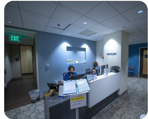
Radiology check-in desk on the 8th floor of Building 2