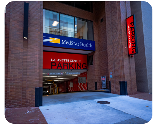
21st Street garage entrance