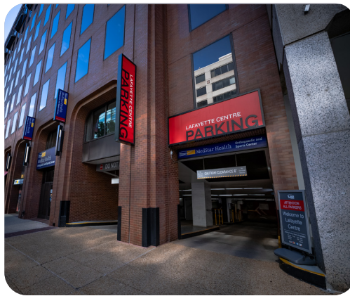
20th Street garage entrance