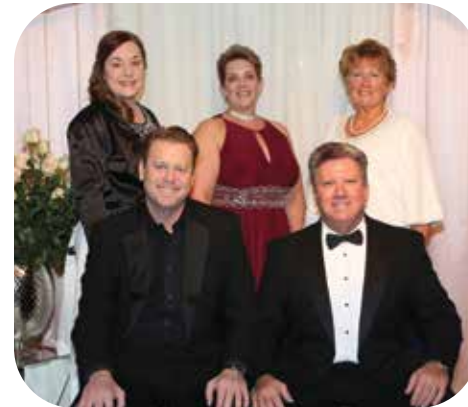
Gala crew in action