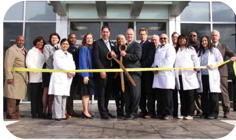
2018 East Run Medical Center ribbon cutting