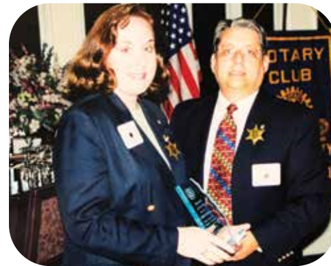
1999 Rotarian of the Year Award