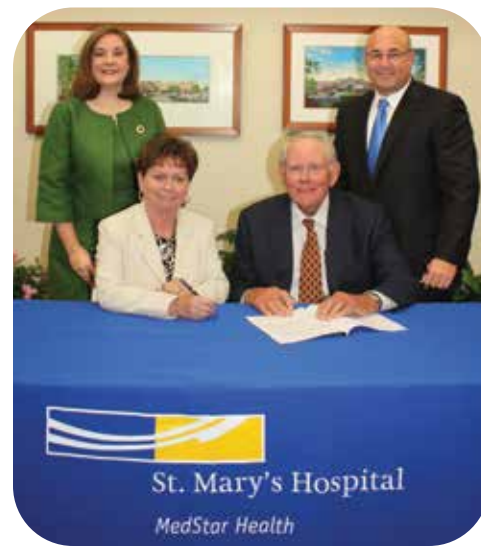
2009 MedStar Health merger signing