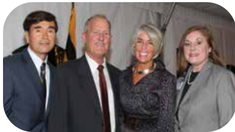
Navy Alliance dinner