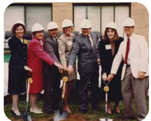
1993 Hospital ground breaking ceremony