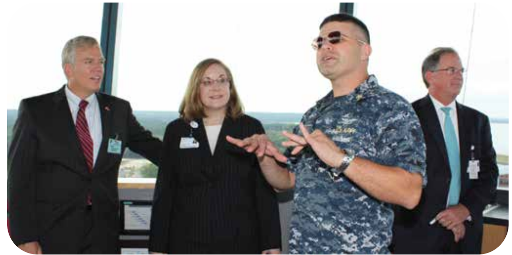
MedStar's introduction to air traffic control tower on base