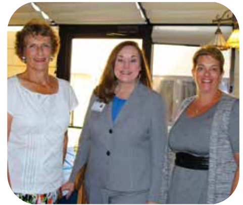
Women leading the charge