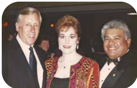
MedStar St. Mary's Gala