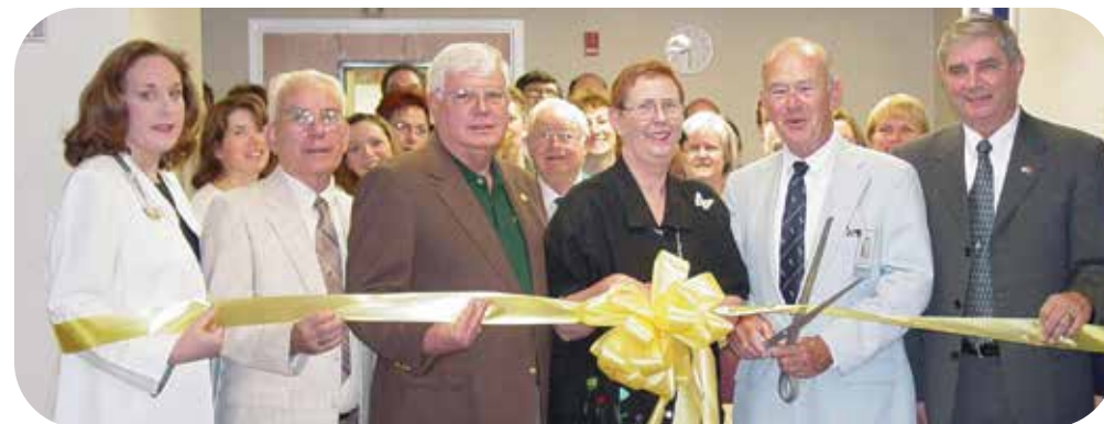
Women's Health & Family Birthing Center ribbon cutting