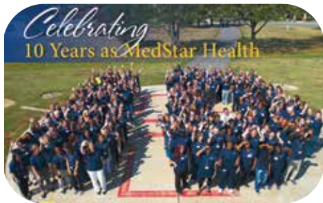
MedStar St. Mary's 10 year anniversary