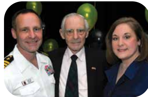
College of Southern Maryland's CEO of the Year