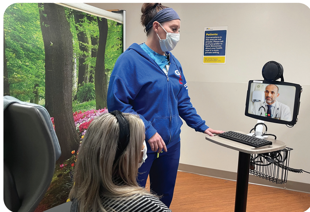
The MedStar St. Mary's Hospital Emergency Department has been working to reduce patient wait times by trialing programs utilizing telehealth providers and a new Rapid Evaluation Treatment Area (RETA) for patients experiencing less severe symptoms.

"RETA, the Rapid Evaluation and Treatment Area, is staffed with a dedicated