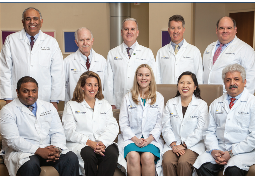
MedStar Georgetown Transplant Institute Team