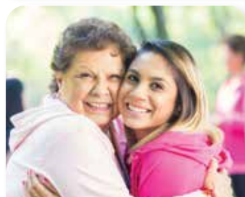
CANCER: THRIVING & SURVIVING