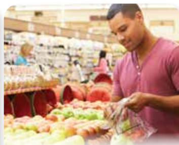
LIVING WELL WITH CHRONIC CONDITIONS