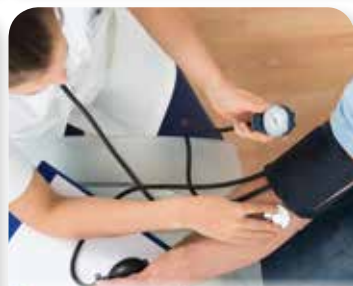
LIVING WELL WITH HIGH BLOOD PRESSURE