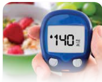
LIVING WELL WITH DIABETES