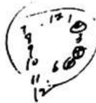
Moderate Cognitive Impairment Score 4