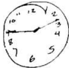
Normal Score 10