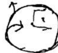
Severe Cognitive Impairment Score 2