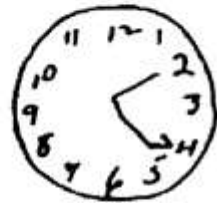
Mild Cognitive Impairment (Numbers error and placement of hands) Score 8