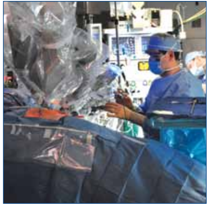
At MedStar Georgetown, surgeons use the da Vinci Surgical System, described on page 4, to make delicate, tiny movements through incisions less than one-half inch long.

Hormone therapy is the standard of care for metastatic prostate cancer—cancer that has spread beyond the gland—as well as other advanced cancers or as a complementary treatment if prostate cancer returns. Unlike radiation and surgery, hormone therapy is not expected to cure the cancer; however, it can stop or even reverse the disease's progression.