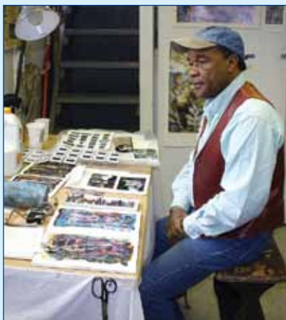
David Driskell in his Hyattsville, Maryland, studio