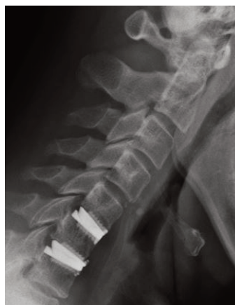
Disc Replacement Flexion

A 61-year-old male physician presented with severe left arm pain and weakness due to cervical spondylosis and a cervical disc herniation. The patient underwent a two-level cervical disc replacement, which resolved his pain and weakness. The disc replacements also allowed him to retain the natural motion of his spine.