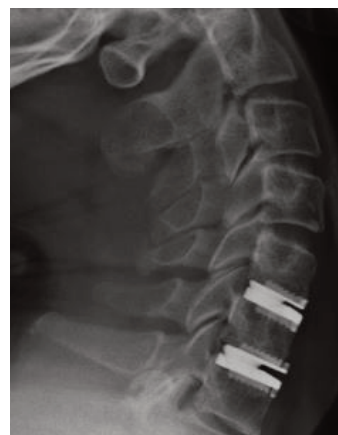
Disc Replacement Extension